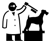
"Ask A Vet"