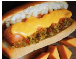
AND OF COURSE... HOT DOGS !