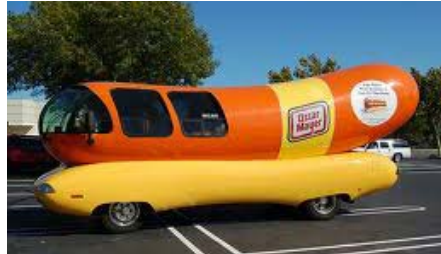
Weiner Dog Races & Weiner Mobile